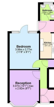
Total area: approx. 49.3 sq. metres (530.4 sq. feet)

Although Mulburries LTD ensures the highest level of accuracy, measurements of doors, windows and rooms are approximate and no responsibility is taken for error, omission or misstatement. These plans are for representation purpose only as defined by RICS code of measurement practice. No guarantee is given on total square footage of the property within this plan. The figure icon is for the initial guidance only and should not be relied on as a basis of valuation. Plan produced using PlanIt360.